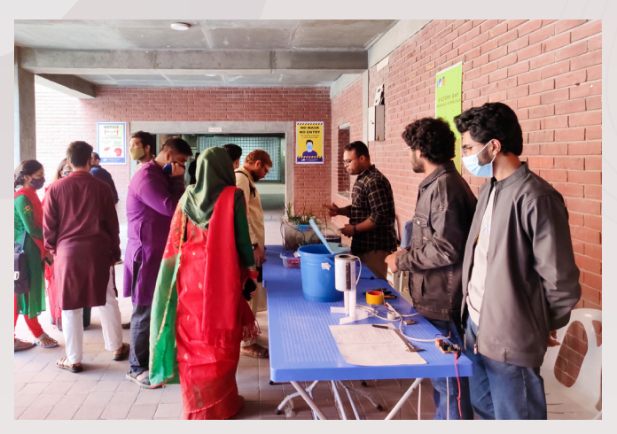
On the Victory Day of Bangladesh, East West University Project Showcase 2021". EWURC displayed three unique projects.