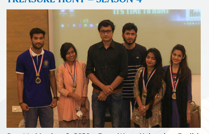
On 1st March of 2020, East West University English Conversation Club (EWUECC) organized one of its signature events entitled "Treasure hun -Season 4".