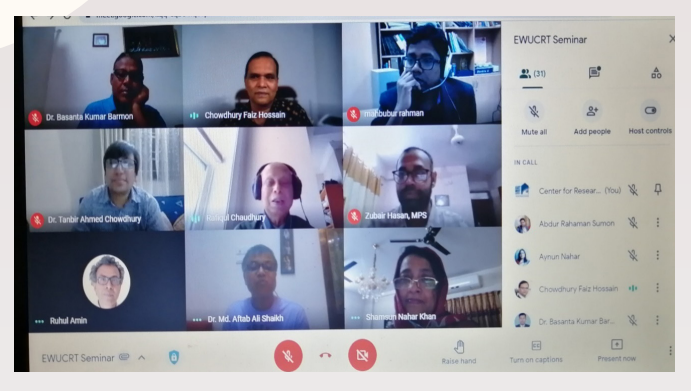
Seminar on "Carbon Based Materials Derived from Metal-Organic Frameworks (MOFs) and Their Application in Electrochemical Supercapacitors"