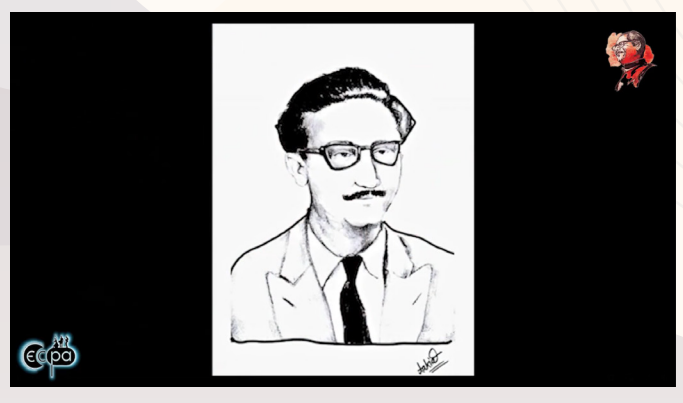
50 er Alokbortika

of the nation through presenting a drama called 'Shomaptir Oshomapti'.