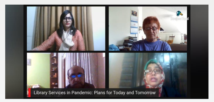
Webinar on the occasion of the 100th birth centenary of the Father of the Nation Bangabandhu Sheikh Mujibur Rahman

To celebrate the birth centenary of the Father of the Nation Bangabandhu Sheikh Mujibur Rahman, Department of Information Studies and Library Management organized a series of webinar.