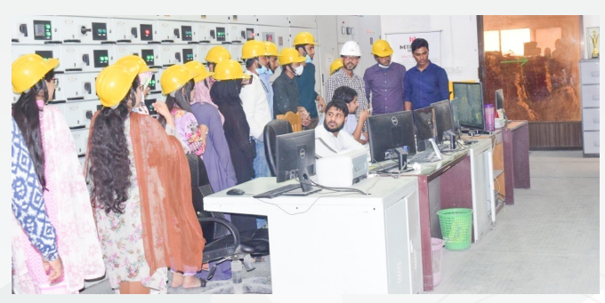
Study tour at Metrocem Cement Limited, Muktarpur, Munshigonj.

On 22<sup>nd</sup> of February, 2020, the Civil Engineering Department of East West University organized a field trip to the cement production factory of Metrocem Cement Limited situated at West Muktarpur in Munshigonj. The trip provided opportunity to the students of the subject 'CE201 Engineering Materials' to obtain practical experience in cement production, storage and distribution system in the factory.