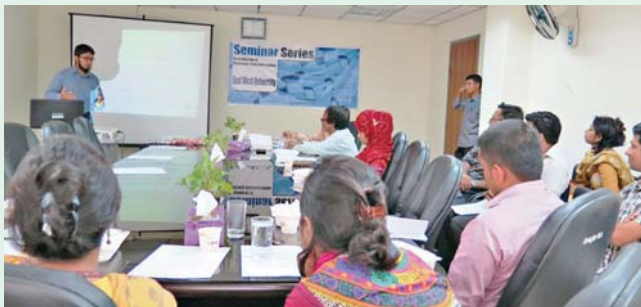
Seminar on "An Alternative Investigation of Weak Form efficiency in Dhaka Stock Exchange Based on Technical Analysis" organized by Department of Business Administration