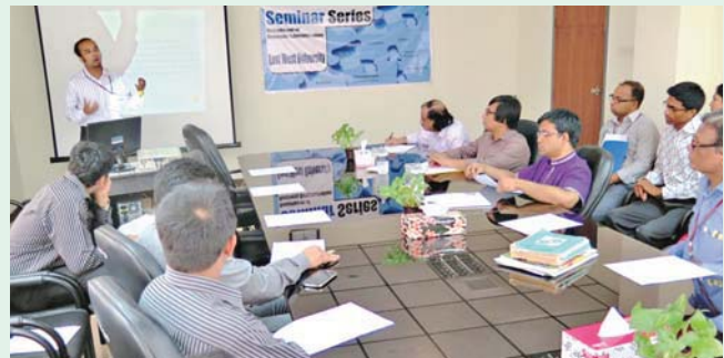
Seminar on 'SME can play key role for enhancing D-8 Countries', organized by Department of Business Administration