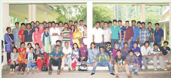
All students and faculty members in survey

field site-a village named "Barai" in Laksam Upazilla. They collected information from 85 households selected by students using simple random sampling based on the existent sampling frame of the village. This survey gave them hands on experience in data collection process. The next step of this survey is to analyse the data and publish a monograph.