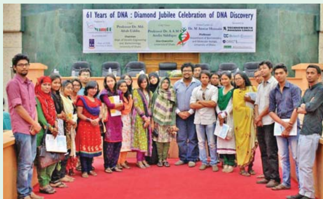
GEB at DU Diamond Jubilee