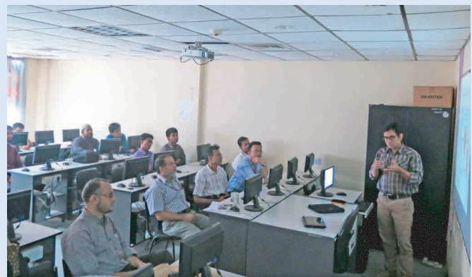
Faculty Members and Students of various departments were present in a research talk organized by ECE department