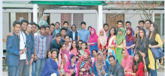
Students with the faculty members

Alpha-Beta Statistics Club has organized a field trip to Gazipur on 4 February 2016 to conduct a short survey on interviewing elderly (40+) citizens of Bilashara village, Gazipur. The purpose of the survey was to give the students hands on experiment on data collection at field level using pre specified questionnaire. Later, students and faculty members enjoyed a picnic at Aronnobash Resort nearby.