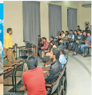
Speaker speaks at the seminar