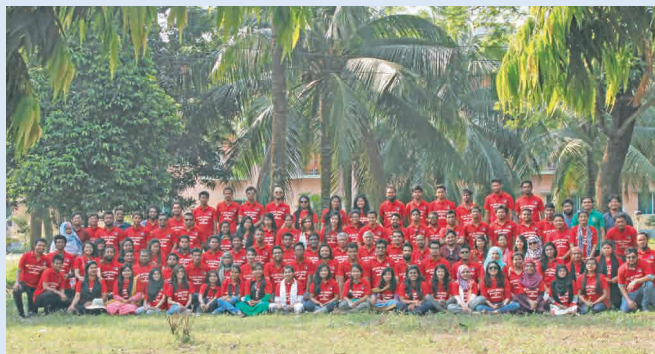
Study Tour to Kuakata