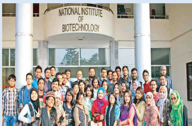
Students and faculty members at National Institute of Biotechnology

The core facility of IFRB is a Cobalt-60 gamma irradiator, which is operated and maintained by Gamma Source Division. The most research activities of the institute are based on gamma irradiation. In addition to research, this source renders limited scale commercial service to private stakeholders particularly to pharmaceutical industries.