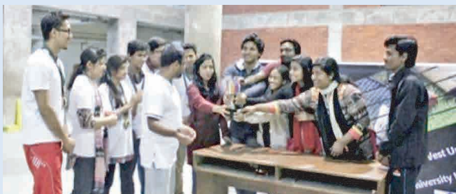
Champion Team DM Super Kings taking winners' cup from the Law Club