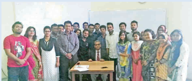
Chief Economist, Bangladesh Bank with the students