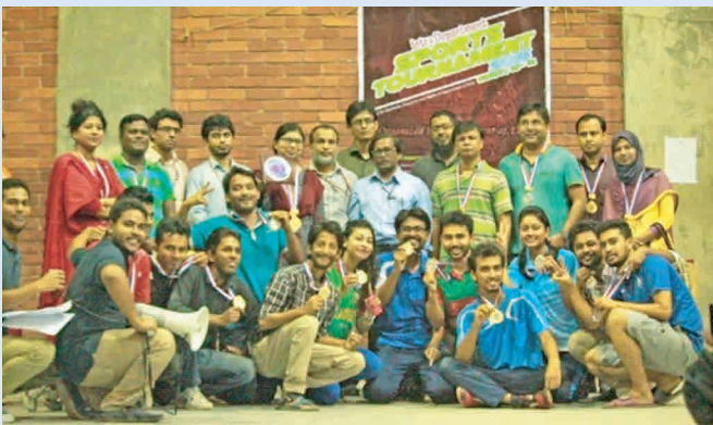
Prize Winners of the Intra Department Sports Tournament 2016 with Dean, Faculty of Sciences and engineering, EWU.