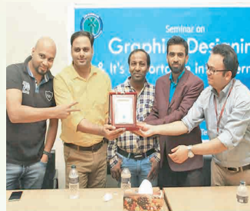
Moderators presenting the award to honorable guest