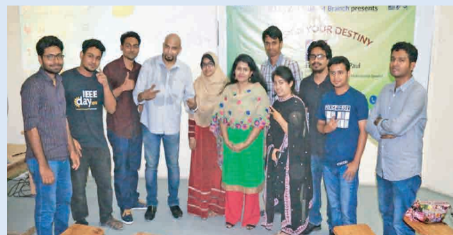
The Guest with the organizers and executive body