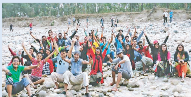
EWUGBC Study Tour at Sylhet

EWUGBC arranged a two-day long study tour to Sylhet from 21-23 January 2016. This exciting tour provided the students of GEB to visit a lot of places including Harzat shah Jalal Majar, Jaflong, Srimongal tea garden, Madhabpur Lake, Manipuri Para, Lawachara Rain Forest etc.