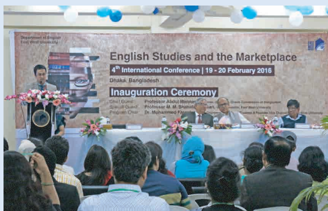
The Conference Inauguration of English Department