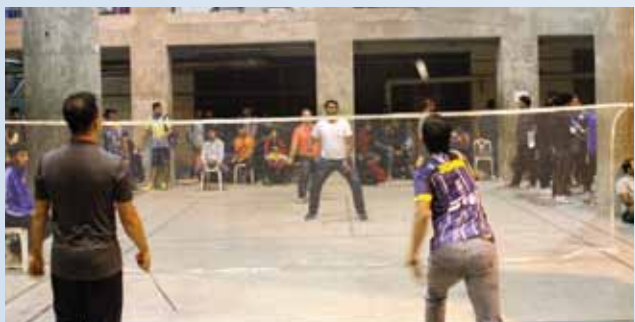
EWU Winter Smash 2019

Among the 175 contenders the winners took their position for the next battle 'EWU WINTER SMASH 2019'.