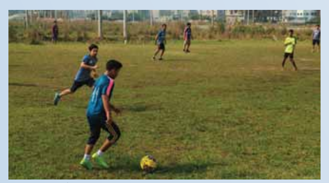
3rd Intra EEE Football Tournament 2019

Students and Alumni of EEE department organized the 3<sup>rd</sup> Intra EEE Football Tournament on March 15-17, 2019. A total of 11 teams participated in the event. The tournament was held at Aftabnagar sports ground.