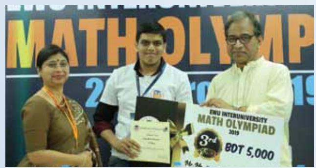
Math Olympiad, 2019