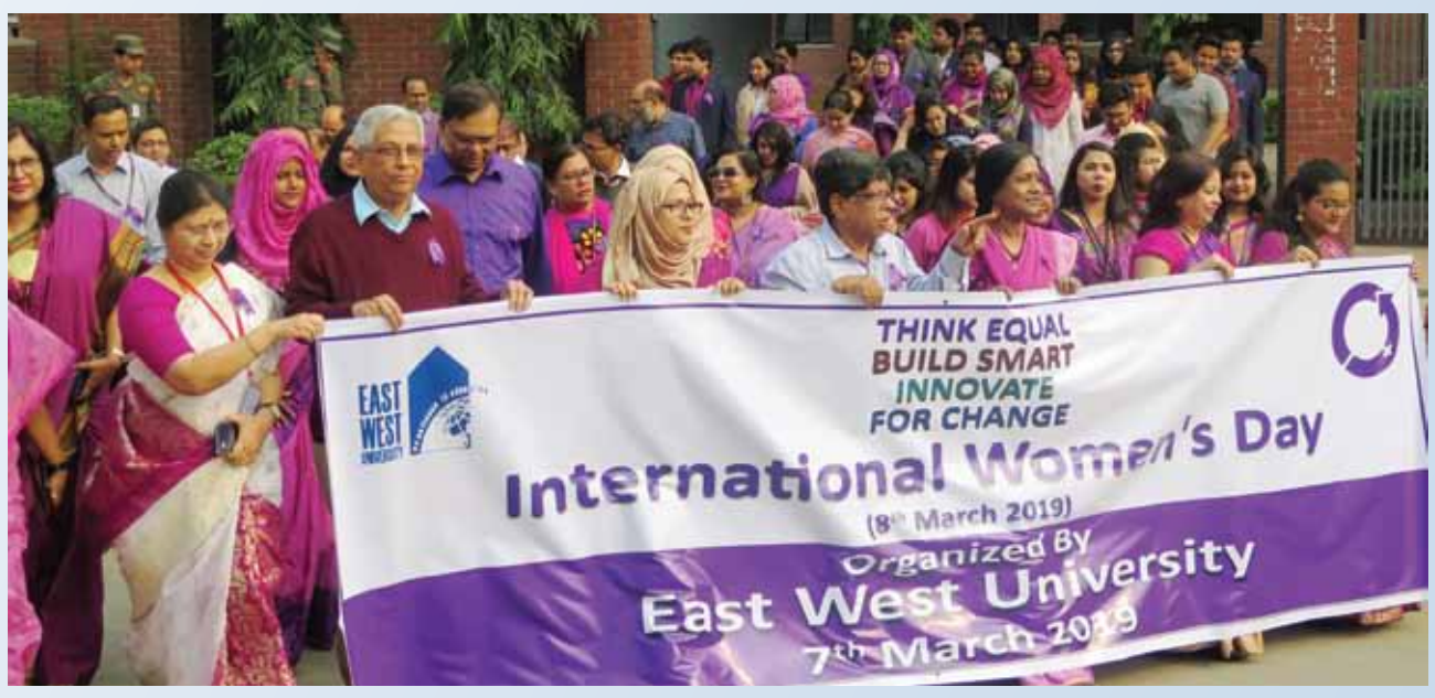
Women's Day Rally

EWU Celebrates International Women's Day 2019