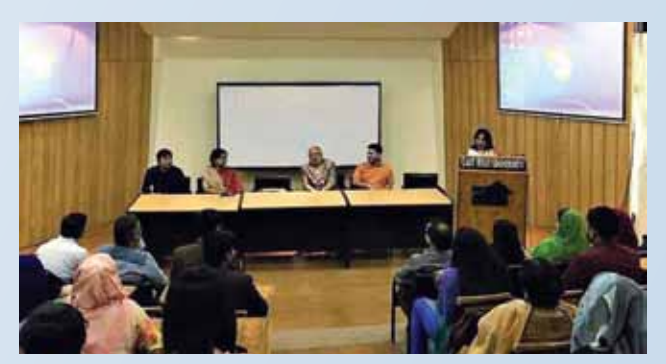
Department of Sociology Organized Teachers-Parents Students Meeting

Department of Sociology organized a parents meeting for the newly admitted students for Spring Semester 2019. The program was held in the S. M. Nousher Ali Lecture Gallery of East West University campus at Aftabnagar, Dhaka on 12<sup>th</sup> February 2019. Approximately 30 students with their parents attended the program.