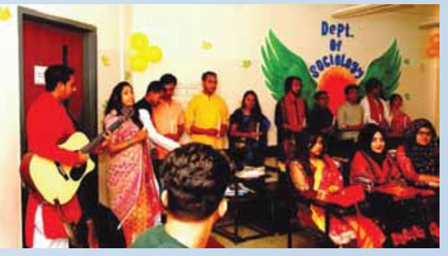
The Farewell Program of the Department of Sociology, Spring 2019

Department of Sociology organized a Farewell program. 26 graduate students expressed their feelings and shared their memory to show