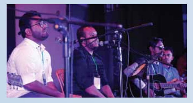
Oporajeyo Bornomala 2019

East West University Club for Performing Arts (ECPA) performed in Inter University Cultural Fest on February 9, 2019 organized by Brac University Cultural Club. Seven prominent universities including East West University participated in the cultural fest. The program took place at TCB Auditorium room in Karwan-Bazar at 1.00 pm. ECPA became champion in the cultural fest.