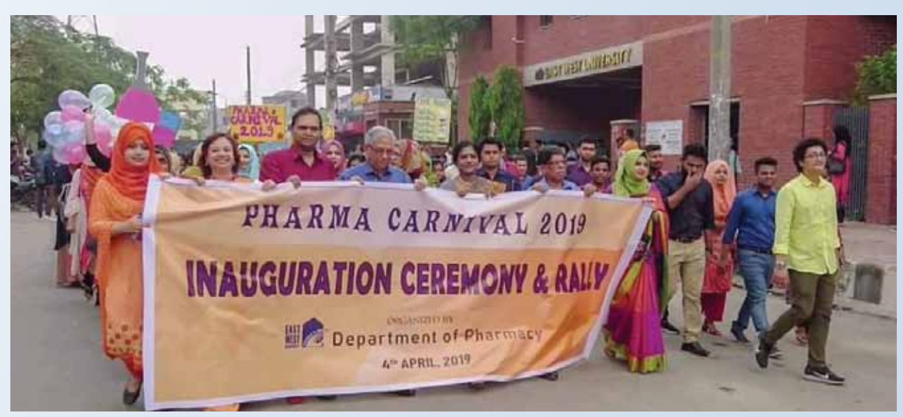
Pharma Carnival 2019 Inauguration Rally

As part of the carnival, the department organized a seminar titled "Bangladesh Pharma Industry: Growth, Opportunity and Challenges" on 11 April 2019, the closing day of the carnival.