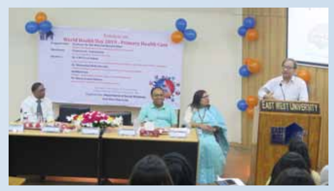
World Health Day seminar

The Department of Social Relations of East West University (EWU) organized a seminar on World Health Day 2019 at the S. M. Nousher Ali Lecture Gallery on 07 April 2019. The seminar highlighted this year's theme 'Primary Health Care'.