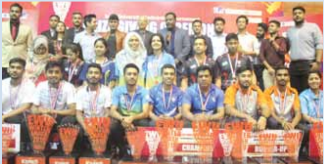
EWU WINTER SMASH 2019 took place from 15th February to 18<sup>th</sup> February at East West University campus. 200 students from Thirty-five universities participated in the event. The tournament was