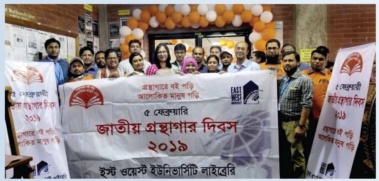
Inaugural rally of National Library Day 2019

in lifelong learning. EWU Library arranged the following activities on this occasion: