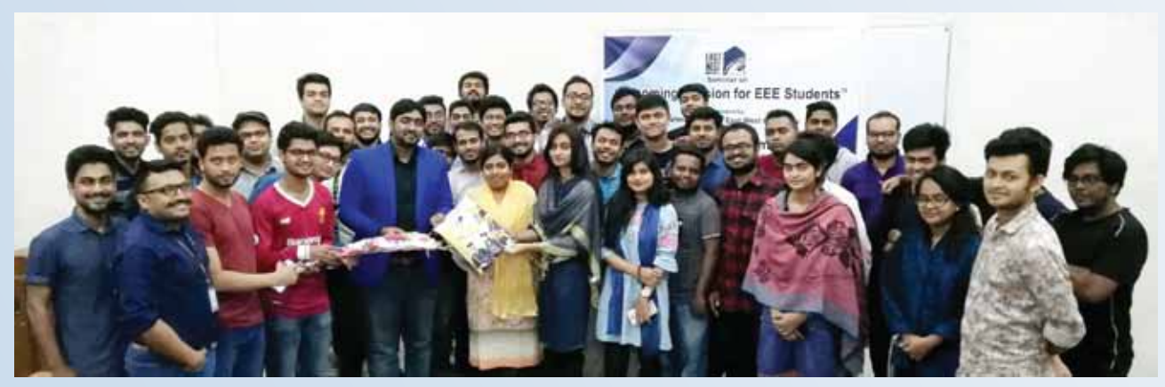
Grooming session for EEE students