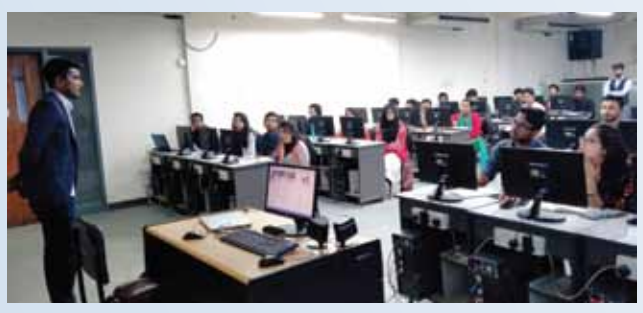
Creative IT Institute's- Training on Graphics Design

Creative IT Institute of Bangladesh, in association with East West University Career Counseling Center, organized a two-day training session on graphics design at the EWU campus. The training started from March 1 and ended on March 2, 2019. 45 students attended the graphics design training. The topics covered in the training were: Graphic Design Elements, Brand Design, and Freelancing Opportunities.