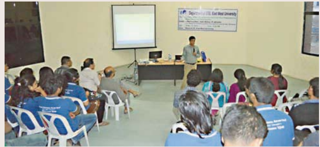
A part of the audience in the seminar on Trend in mobile chip development and your preparation to embrace career opportunities

Munich, Germany delivered a talk on "Trend in mobile chip development and your preparation to embrace career opportunities" on March 18, 2014.